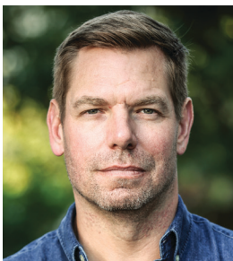
HONORABLE Eric Swalwell Member of Congress