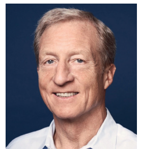
Tom Steyer Business Leader, Climate Advocate