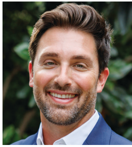
HONORABLE Ian Calderon Former State Assembly Member