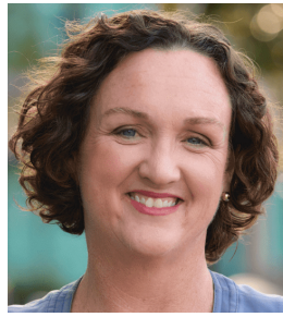
HONORABLE Katie Porter Former Member of Congress