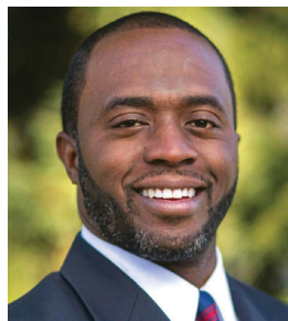
HONORABLE Tony Thurmond California Superintendent of Public Instruction