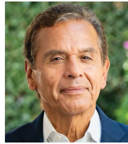
HONORABLE Antonio Villaraigosa Former Los Angeles Mayor