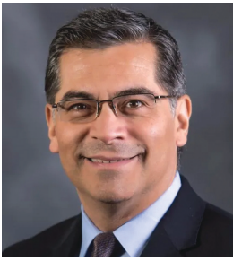
HONORABLE Xavier Becerra Former U.S. Secretary of Health and Human Services