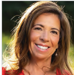
Debra Archuleta LA County Superior Court Judge