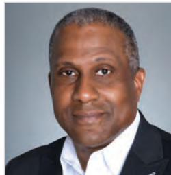
Tavis Smiley Talk Radio Host and Chief Visionary Officer, KBLA Talk 1580