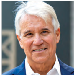
George Gascón LA County District Attorney